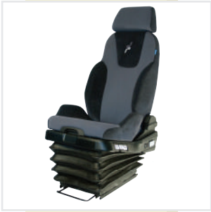
Cushion angle adjustable 16°