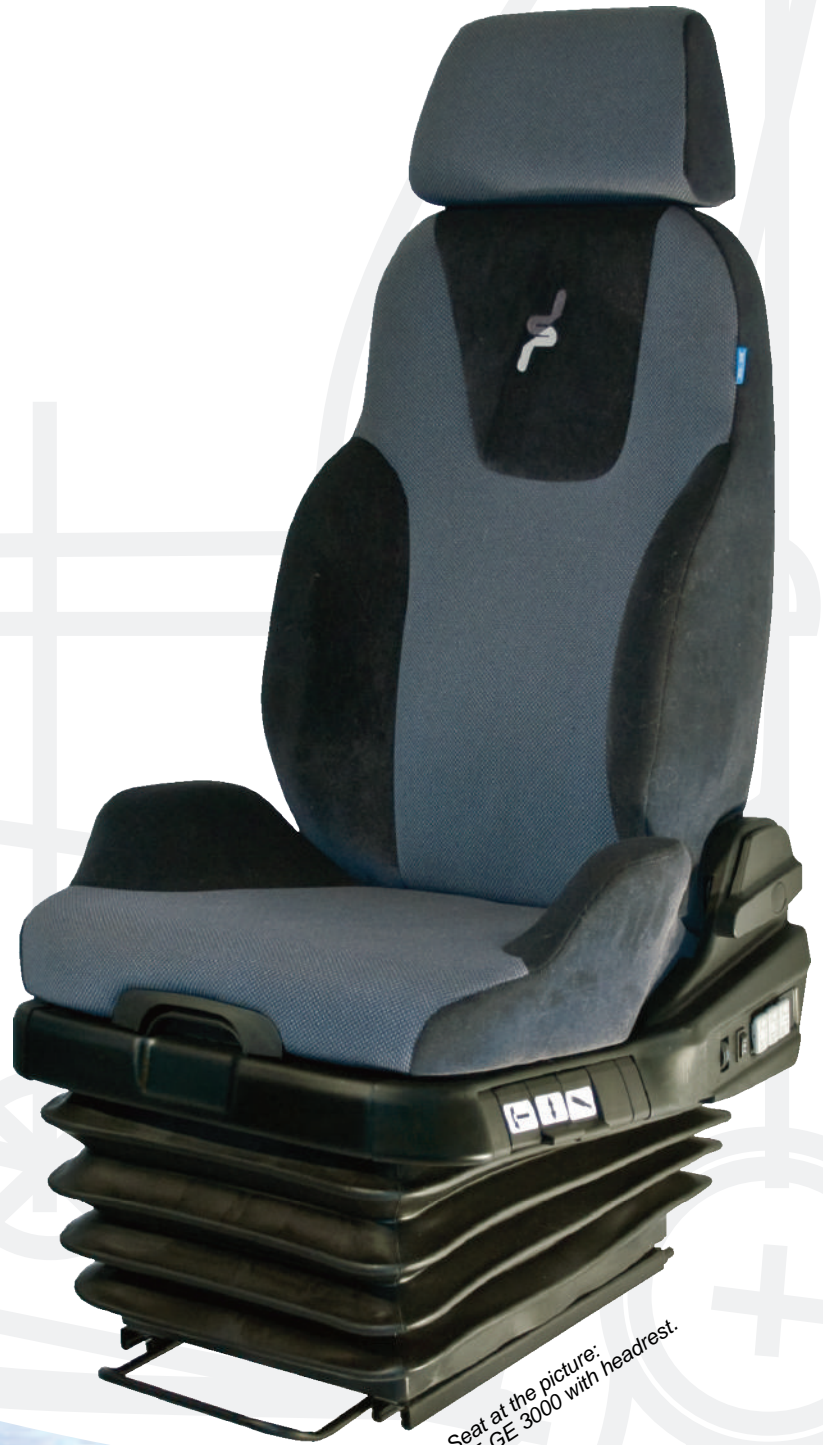
Seat at the picture: BE-GE 3000 with headrest.