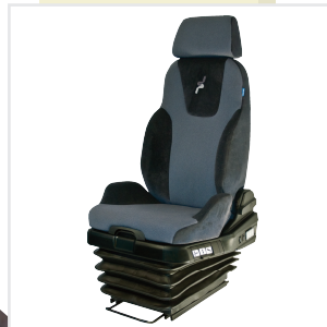
120 mm height adjustment