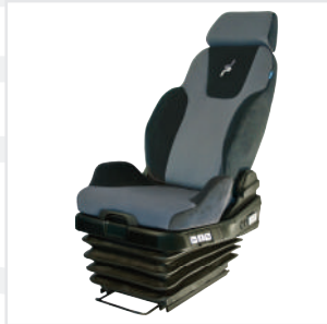
Backrest adjustable 74°