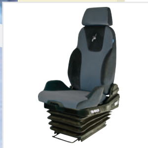
Front edge adjustment