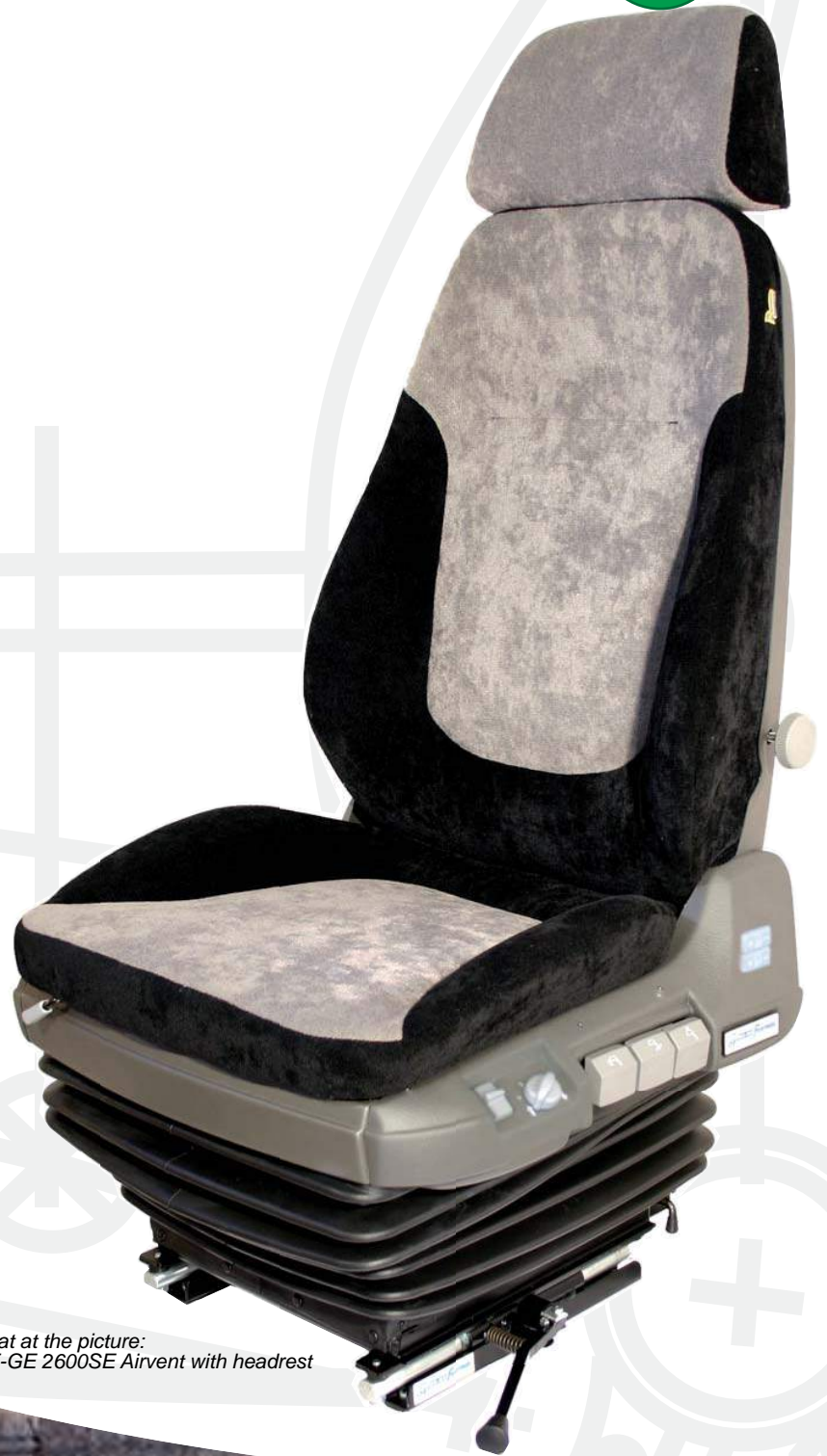
Seat at the picture: BE-GE 2600SE Airvent with headrest