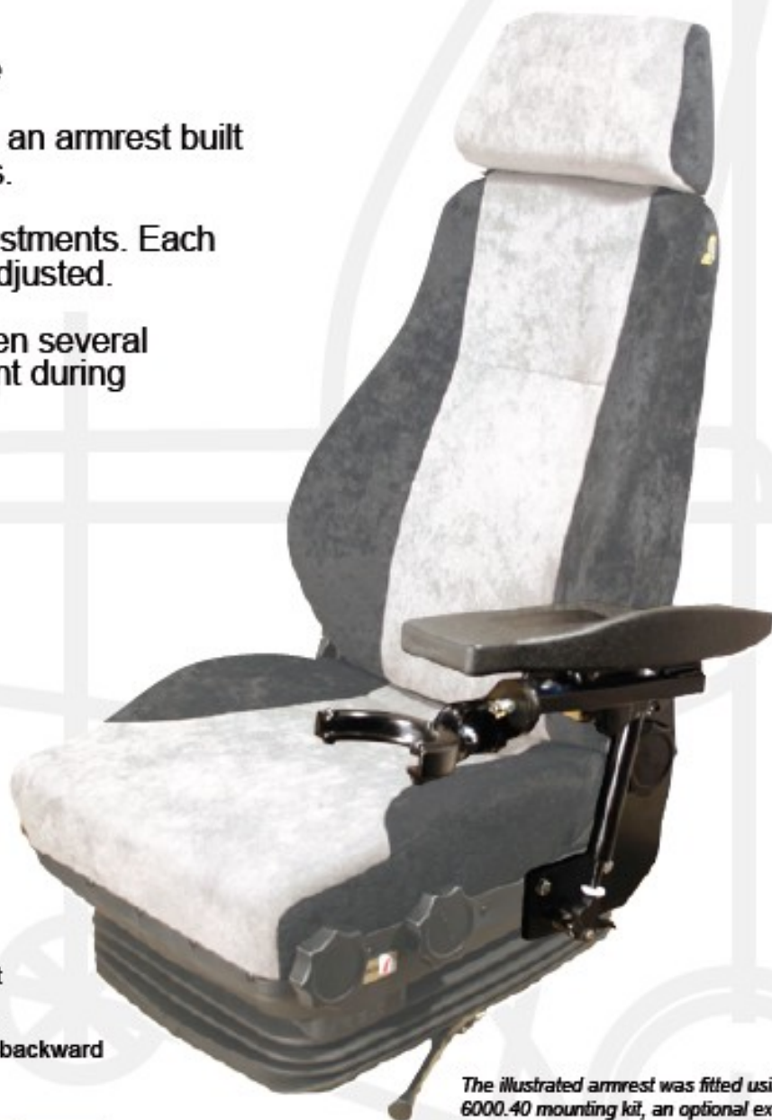
The illustrated armrest was fitted using 6000.40 mounting kit, an optional extra.