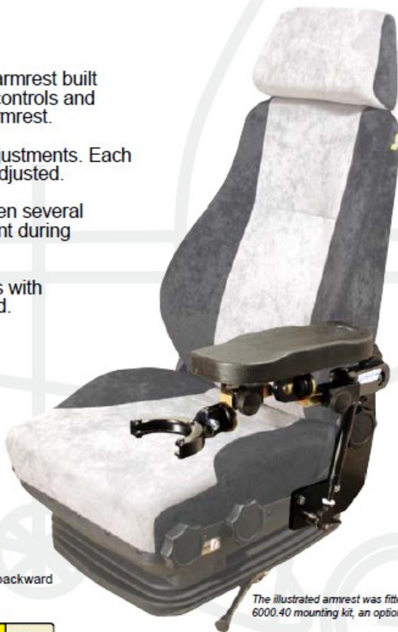
The illustrated armrest was fitted using 6000.40 mounting kit, an optional extra.