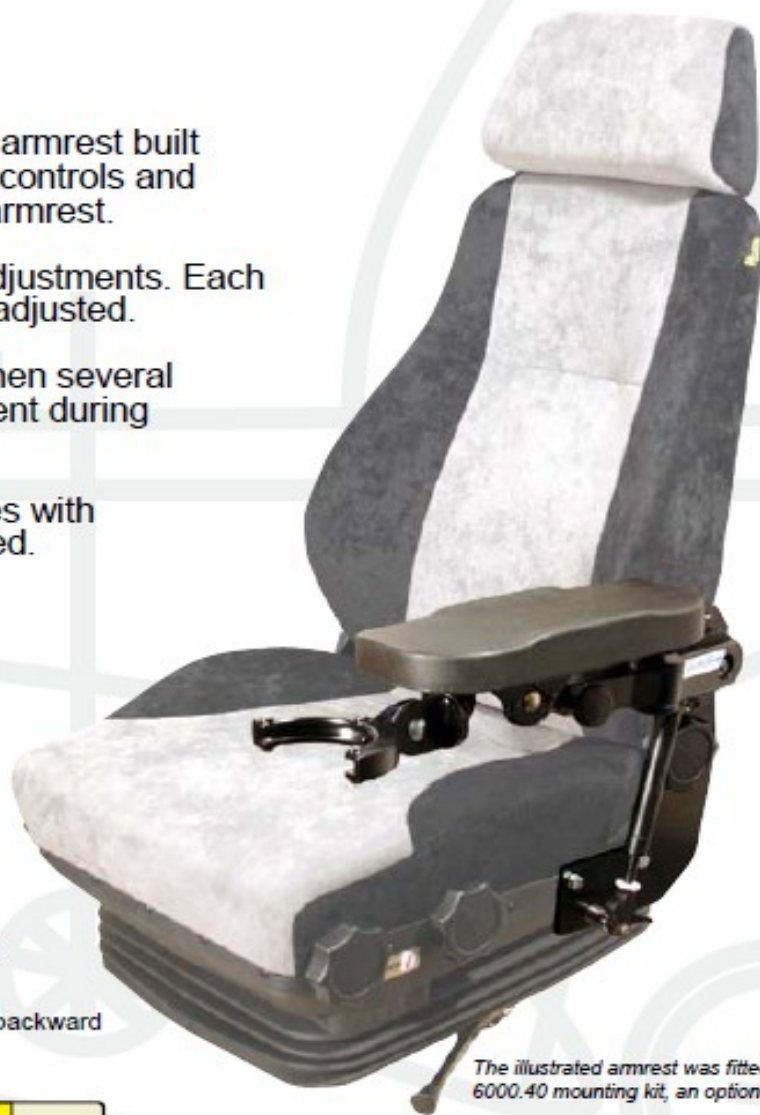
The illustrated armrest was fitted using 6000.40 mounting kit, an optional extra.